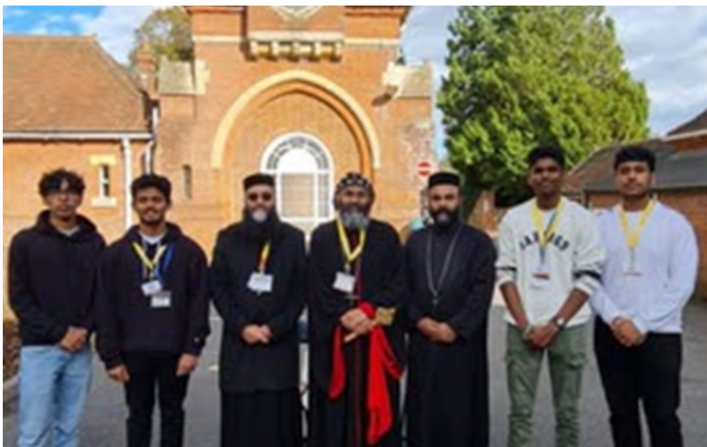
With thirumeni and president achen at Aura